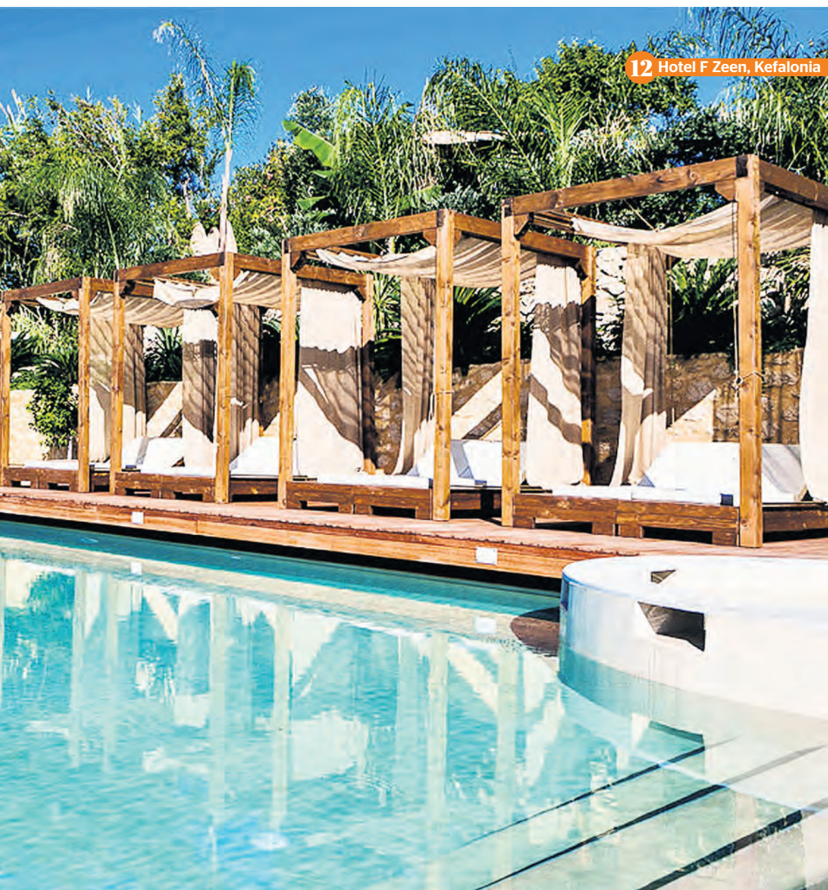
12 Hotel F Zeen, Kefalonia

makes the most of the glorious autumn light and gorgeous scenery. Departing September 24, you will have the chance to paint everything from the elegant Venetian architecture in Rovinj to the Roman amphitheatre at Pula.