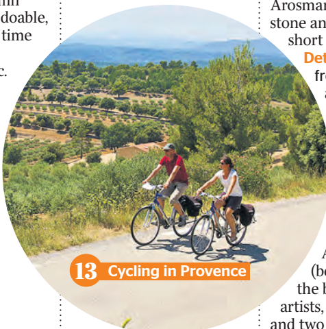
13 Cycling in Provence