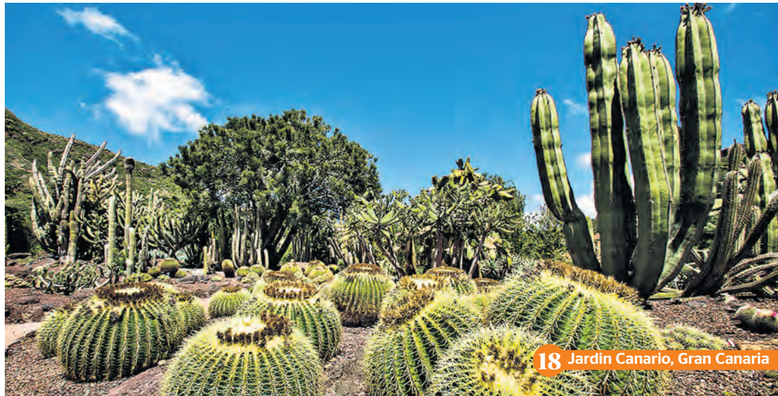
SABINE LUBENOW/GETTY IMAGES