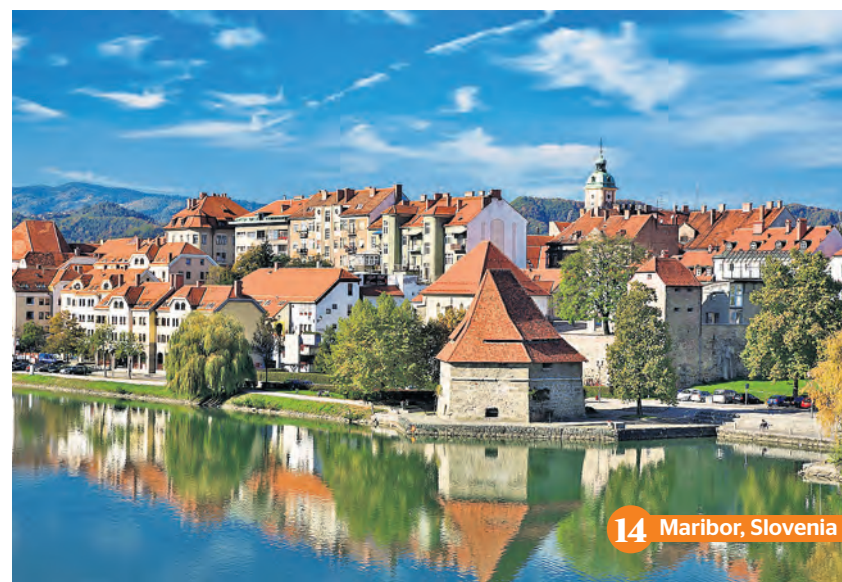
14 Maribor, Slovenia

For the whole of October and into November, the Slovenian city of Maribor