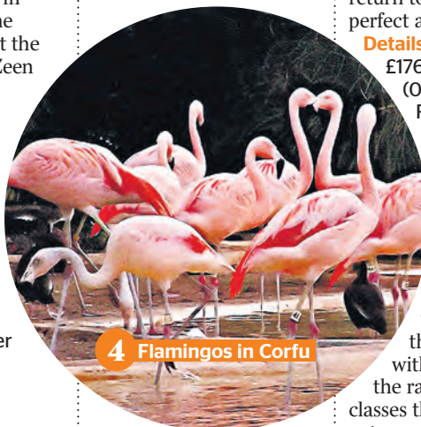
4 Flamingos in Corfu

Details B&B doubles are from £80 a night (barcelohamiltonmenorca.com)